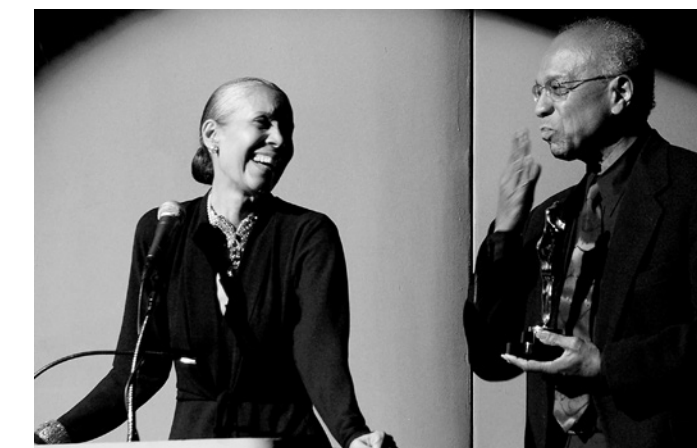
Donald McKayle, 2005 Lifetime Achievement Award recipient presenting the Lifetime Achievement Award to Carmen de Lavallade in 2004.